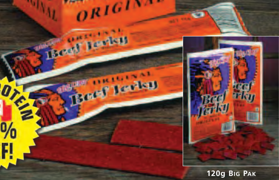
120g BIG PAK