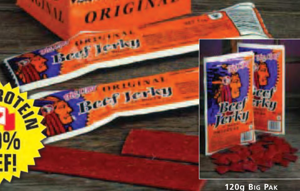
120g BIG PAK